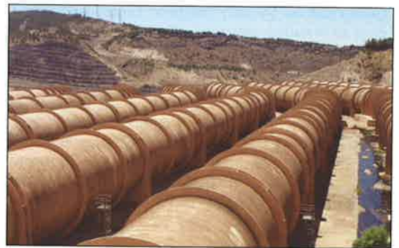
Penstocks at the Atatürk plant.