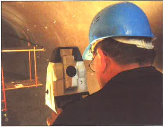
Taking measurements with the theodolite.

path installation with two crossed planes was proposed. The position of the sensors and the weight of the individual paths are specifically optimized. Four of the six penstocks will be equipped with internally mounted sensors. This became necessary because the non-embedded penstock section is not long enough for an externally mounted sensor installation. At both powerplants a total station theodolite is used to determine the exact shape of the conduit within the measurement section (see photo above). This is also used to determine the final sensor positions.