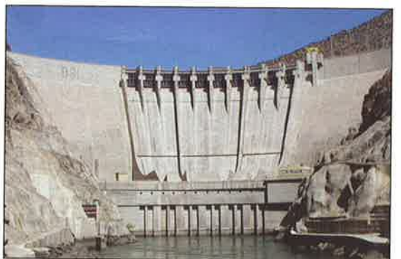
General view of the Karakaya dam and hydro plant.