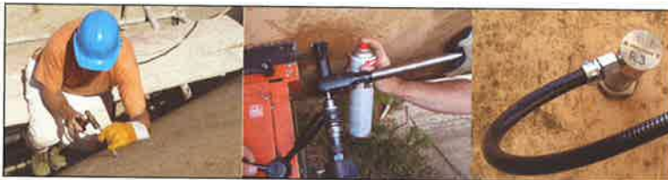
Above: Centre punching of a sensor position (left); tapping of sensor hole (left); and, installed transducer (right).

At Karakaya, the two bends between the intake and measuring section (see Fig. 1) are responsible for a highly disturbed velocity profile. To achieve the best possible accuracy, Rittmeyer used computational fluid dynamics (CFD) for the numerical simulation of the flow in the measuring and upstream section (see Fig. 2). The simulation itself was carried out by Prof. T. Staubli of Lucerne University of Applied Sciences and Arts, Switzerland. As a result of the simulation, an 8-